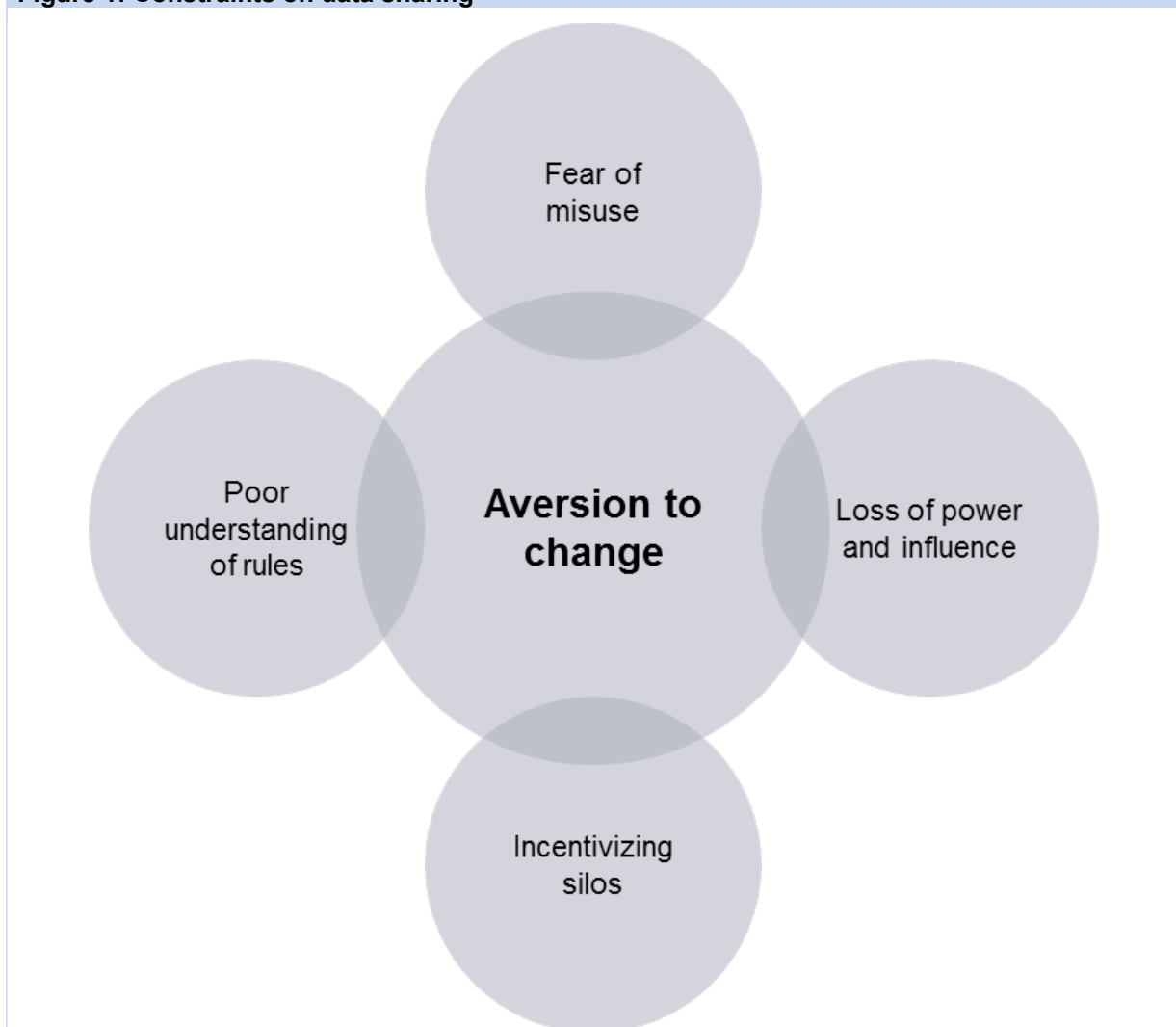
Figure 1: Constraints on data sharing